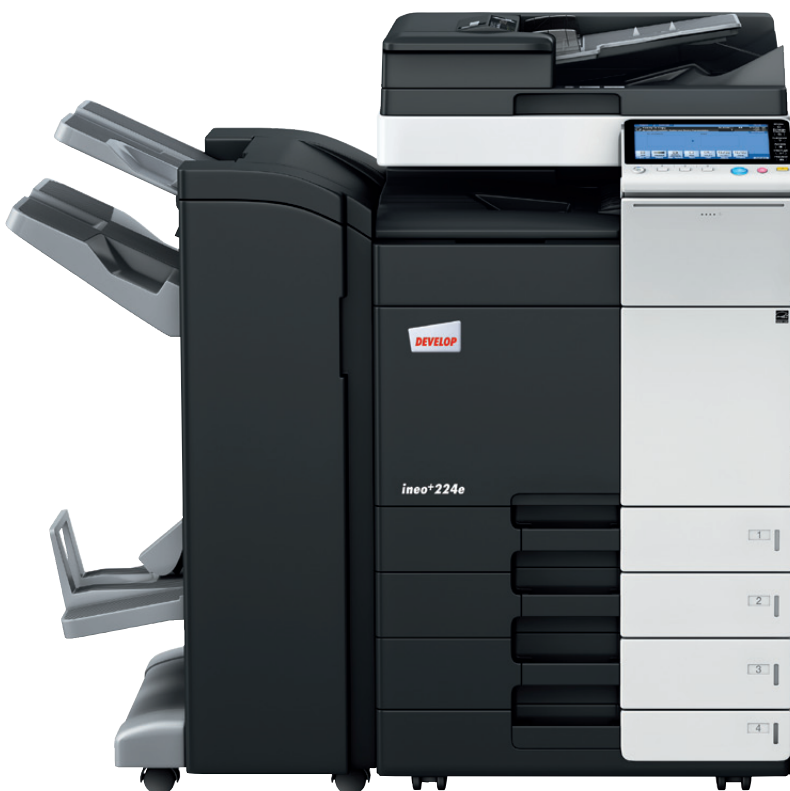
ineo+ 224e with staple/booklet finisher (FS-534SD), paper feeder (PC-210), dual scan document feeder (DF-701), banner tray (BT-C1e)

Many multifunctional office systems are anything but user-friendly. The ineo+ 224e, in contrast, is simplicity itself. An intuitive, easily understandable operating concept ensures that it is as easy to use as your smartphone or tablet. The 9-inch capacitive touchscreen comes with familiar multi-touch operations such as flick, drag&drop and pinch in&out – so you will feel at home in this system in no time at all. Thanks to a new menu navigation structure you can see all functions in one go and select the settings you want with just a few clicks. Frequently used functions can be left on the start screen and ones you don't use simply removed. With such an user-friendly and customisable office system you will find routine document production jobs become much more enjoyable.