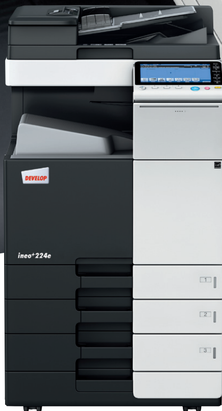
ineo+ 224e with paper feeder (PC-210) and dual scan document feeder (DF-701)