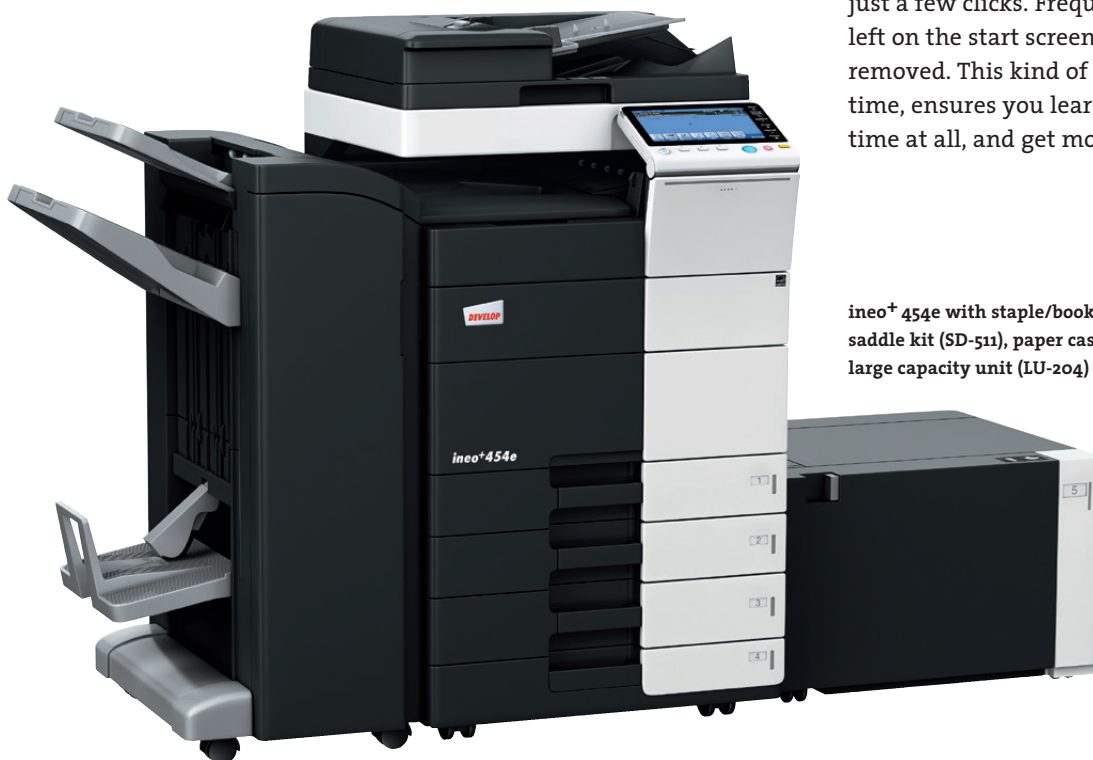
ineo+ 454e with staple/booklet finisher (FS-534SD), saddle kit (SD-511), paper cassettes (PC-210) and large capacity unit (LU-204)

Many multifunctional office systems are anything but user-friendly. The ineo+ 454e, in contrast, is simplicity itself. An intuitive, easily understandable operating concept ensures that it is as easy to use as your smartphone or tablet. The 9-inch capacitive touchscreen comes with well-known multi-touch operations such as flick, drag&drop or pinch in&out. Thanks to a new menu navigation structure you can also see all functions in one go and select the settings you want with just a few clicks. Frequently used functions can be left on the start screen and ones you don't use simply removed. This kind of customisation saves you lots of time, ensures you learn to operate the system in no time at all, and get more fun out of routine office jobs.