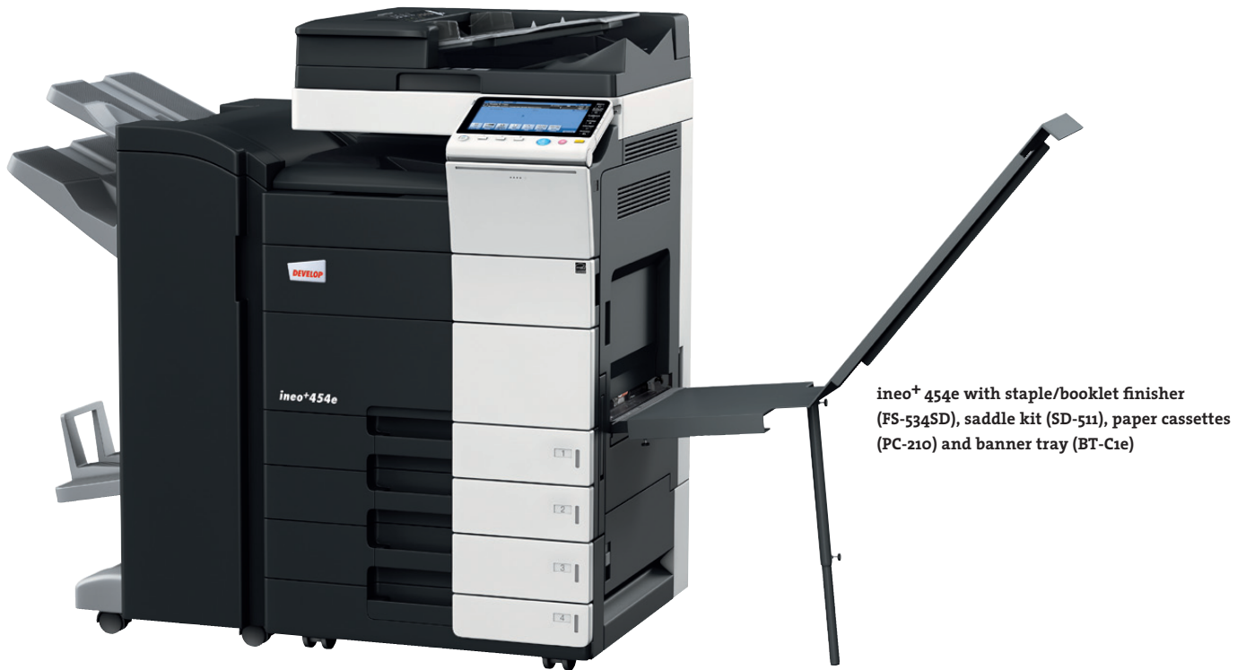
ineo+ 454e with staple/booklet finisher (FS-534SD), saddle kit (SD-511), paper cassettes (PC-210) and banner tray (BT-C1e)