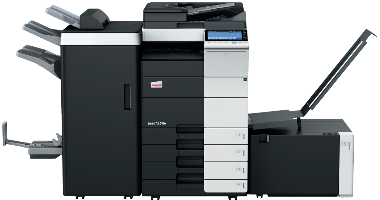
ineo+ 554e with staple finisher (FS-535), saddle kit (SD-512), job separator (JS-602), paper cassette (PC-210), large capacity unit (LU-204) and banner tray (BT-C1e)